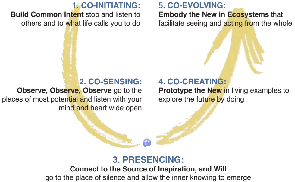
Figure 3. The U as One Process with Five Movements: In order to move from Field 1 or 2 to Field 3 or 4 ways of operating, we need to move first into intimate connection with the world and to a place of inner knowing that emerges from within, followed by bringing forth the new, which entails discovering the future by doing.